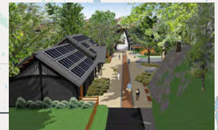
Walkway Over the Hudson