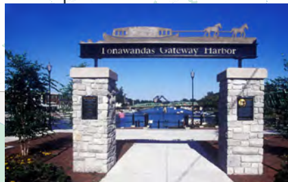
Tonawandas Gateway Harbor