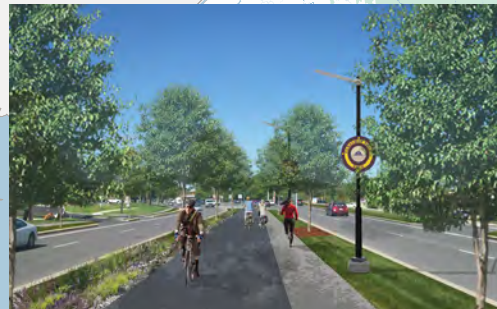
Erie Boulevard Dewitt