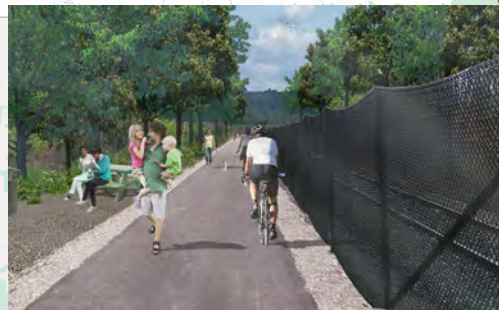
Beacon Rail Trail